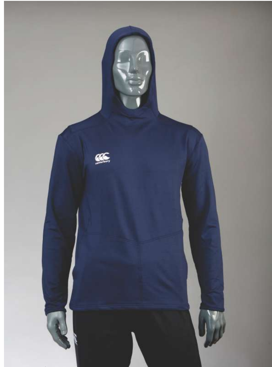
N A V Y