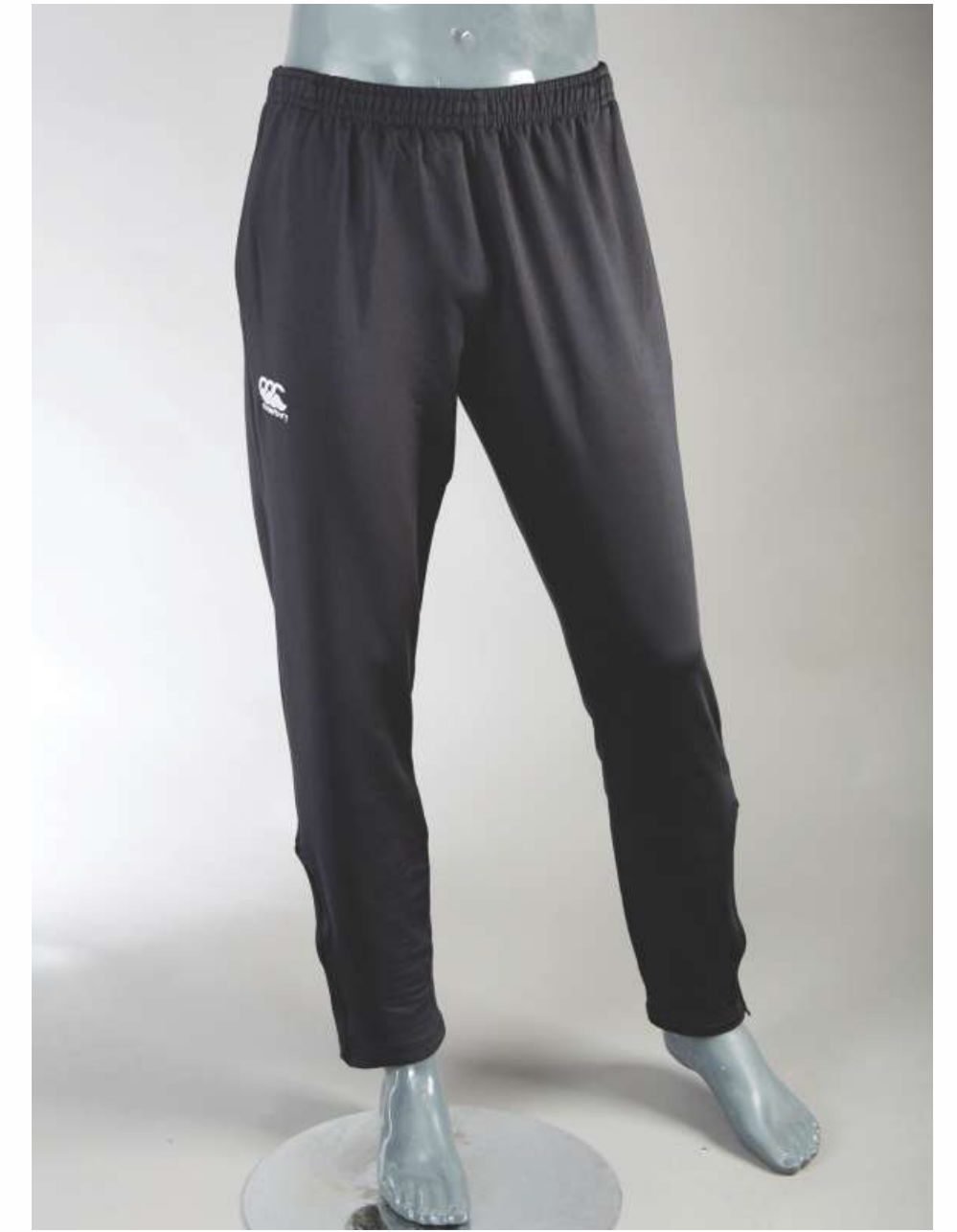
B L A C K

These men's Tapered Pants are ideal for exercising or chilling out on a rest day.