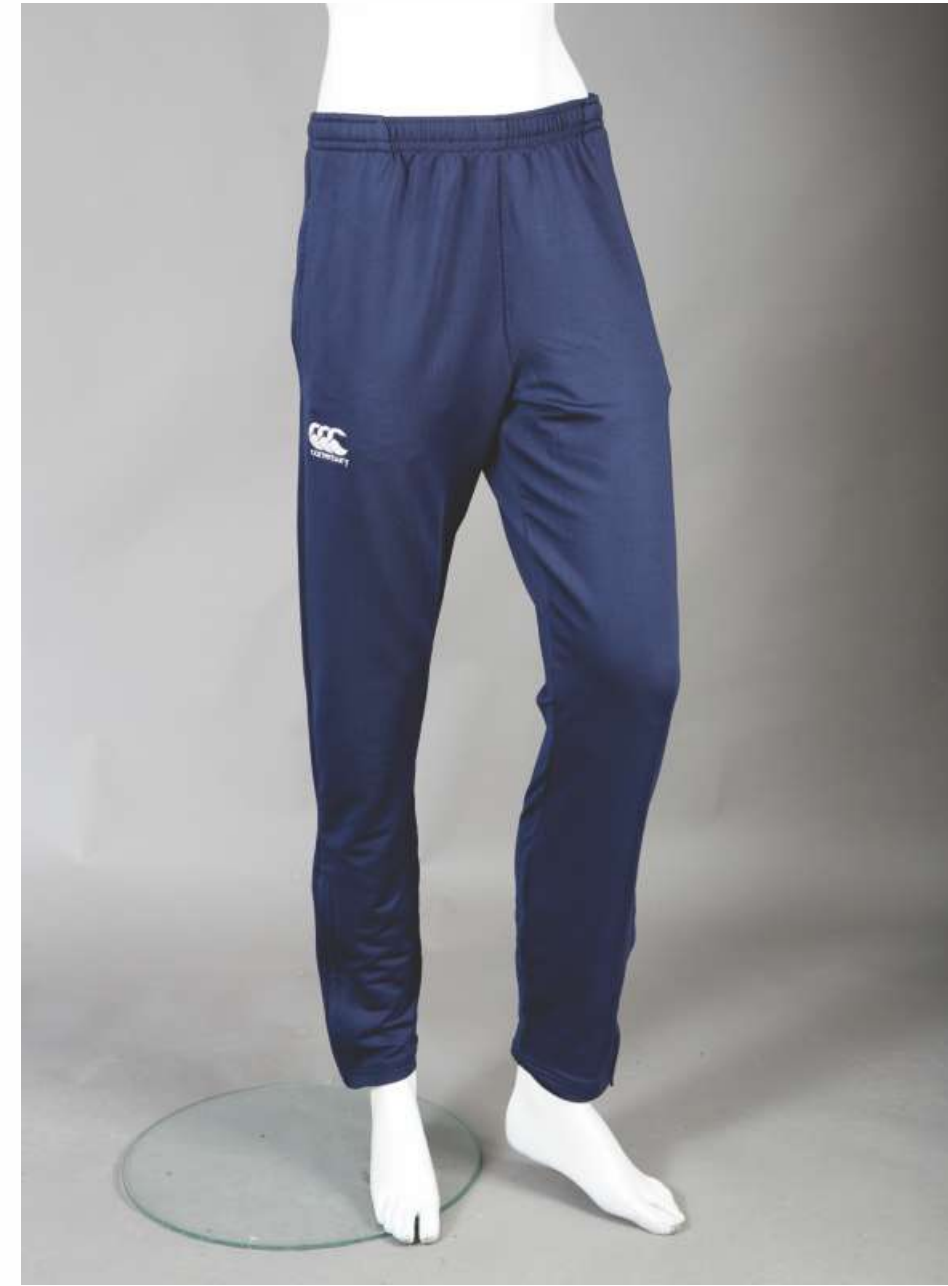
N A V Y