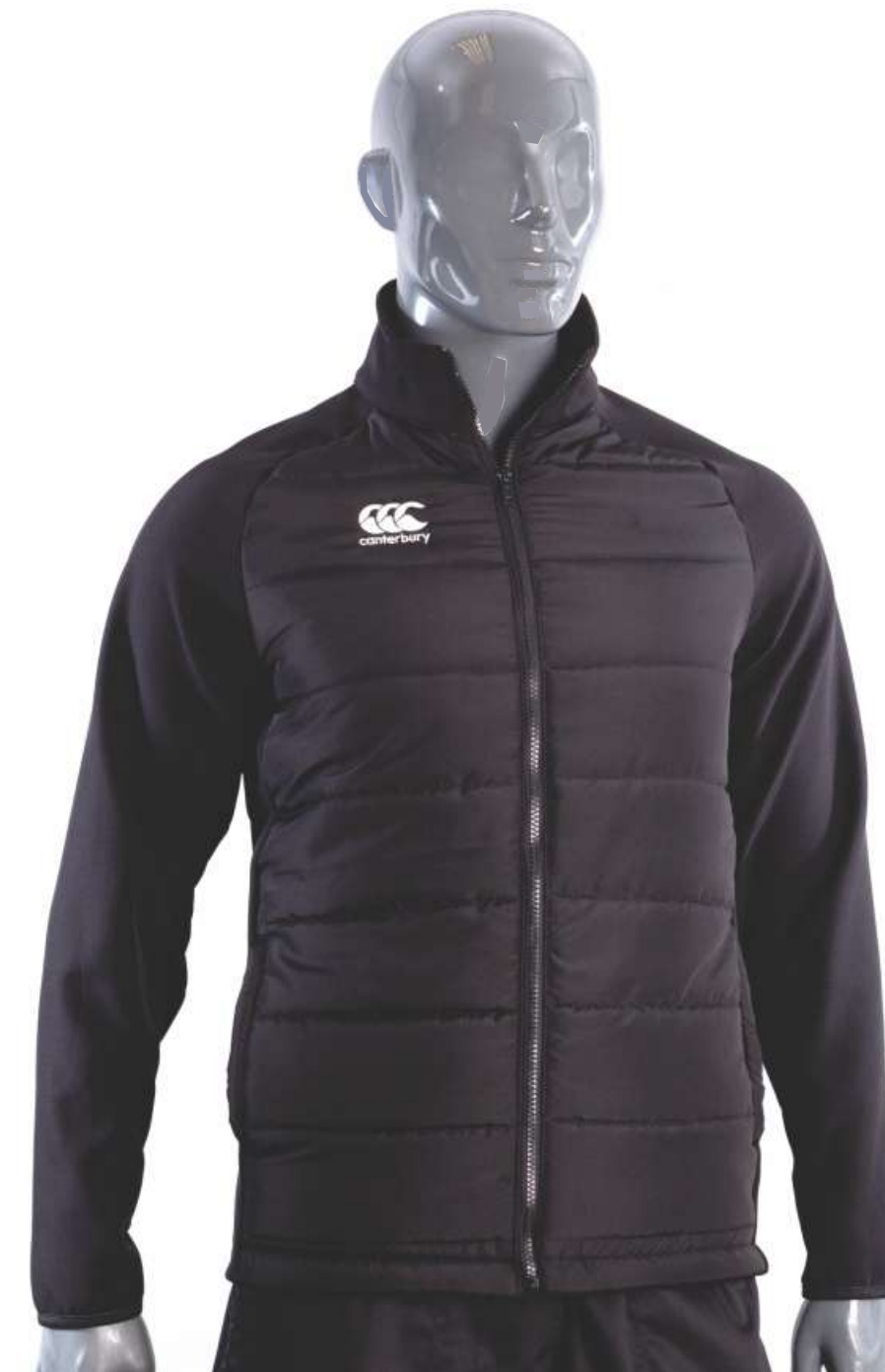
B L A C K

This men's hybrid jacket provides ultimate protection from the elements whether you're playing or supporting.