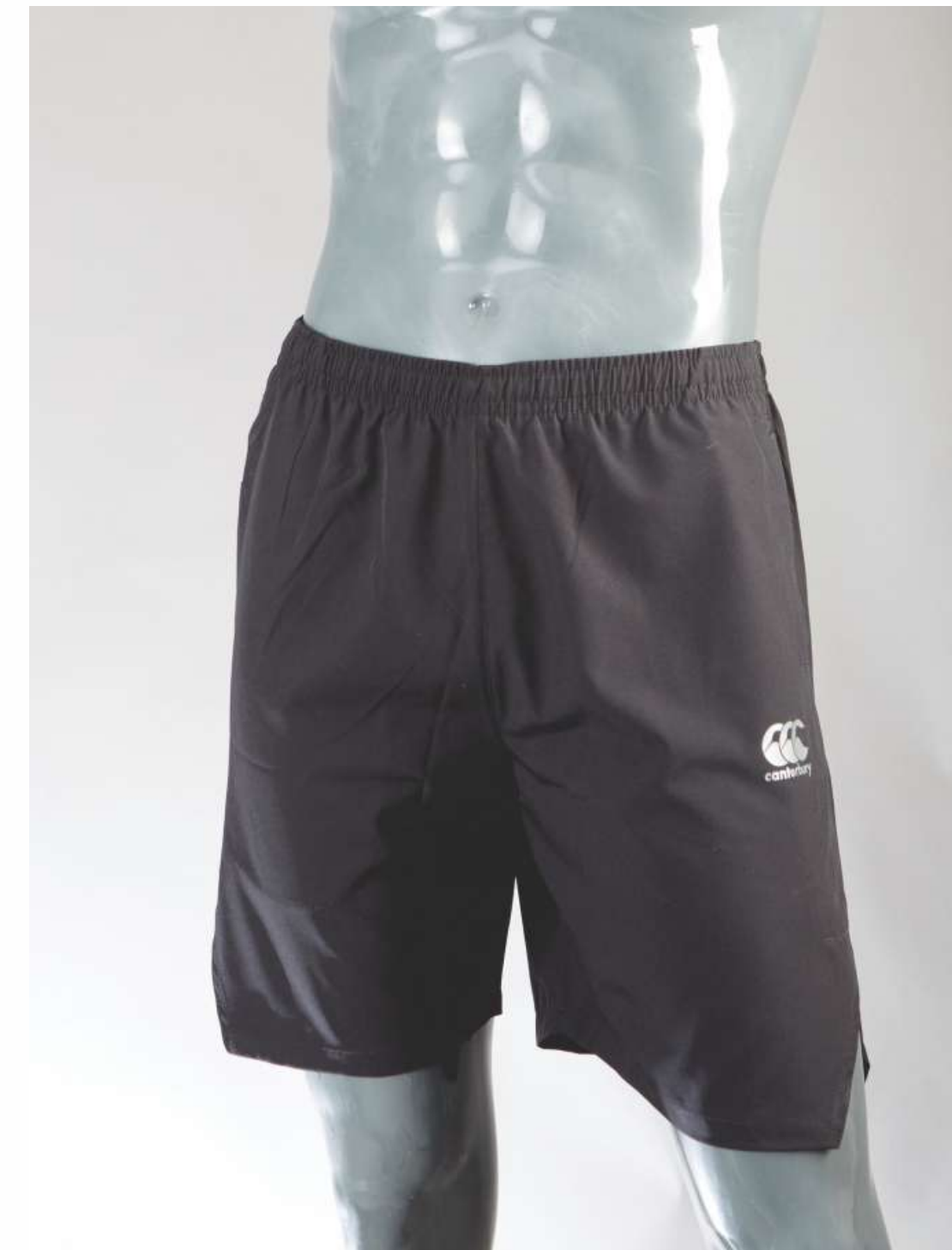
B L A C K