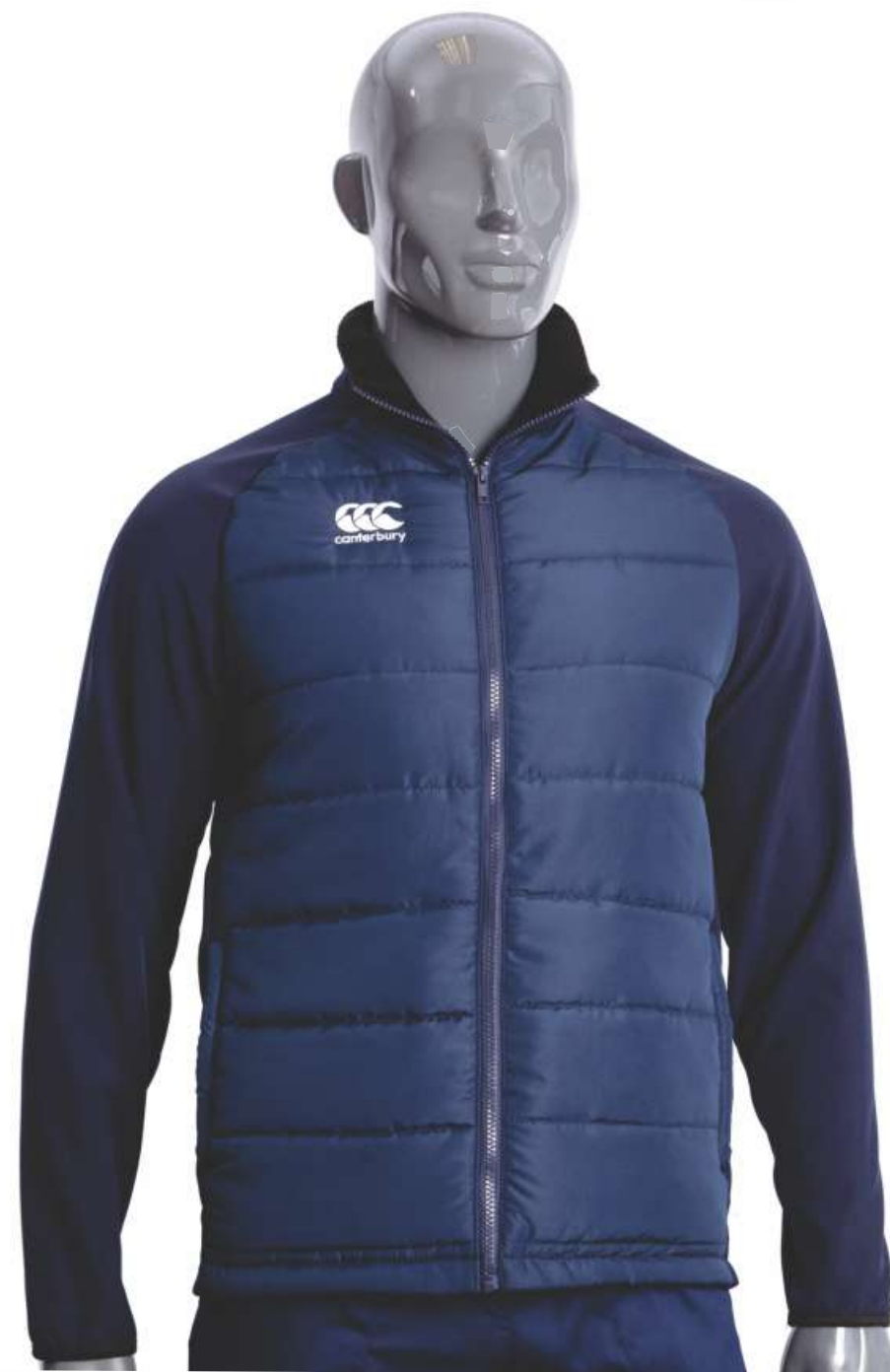
N A V Y