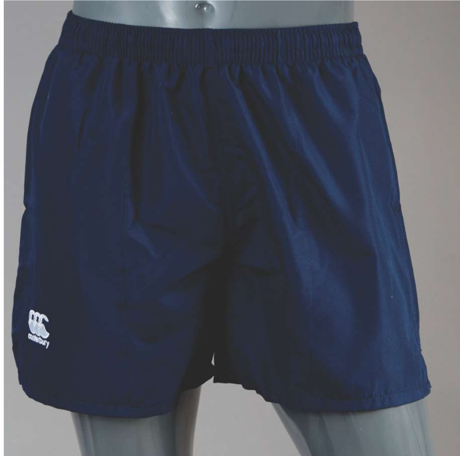
N A V Y