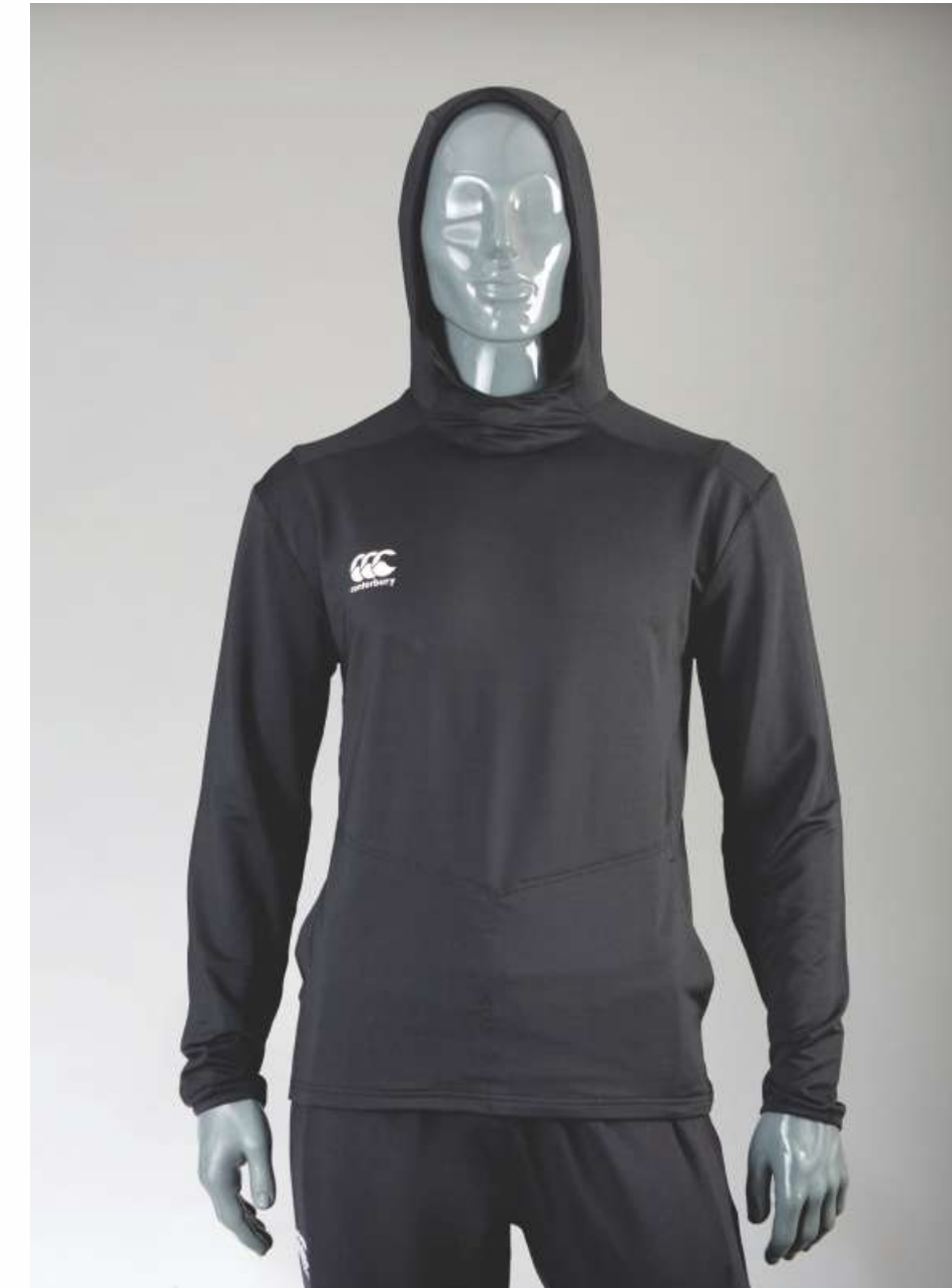
B L A C K