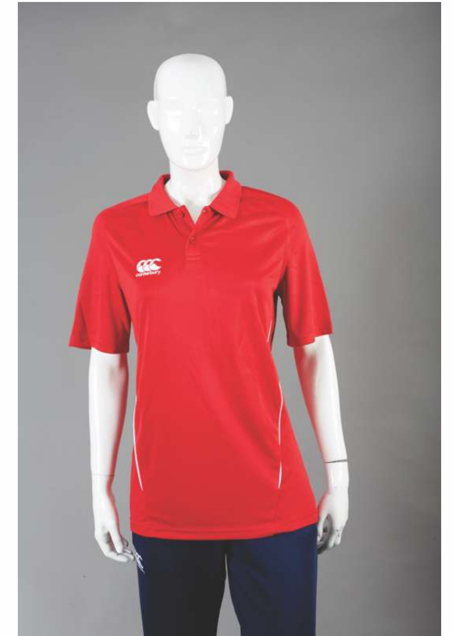
R E D

The Team Dry Polo is designed to help you look great on and off the field, so you can effortlessly transition to everyday life after a training session or simply choose how you want to wear it.