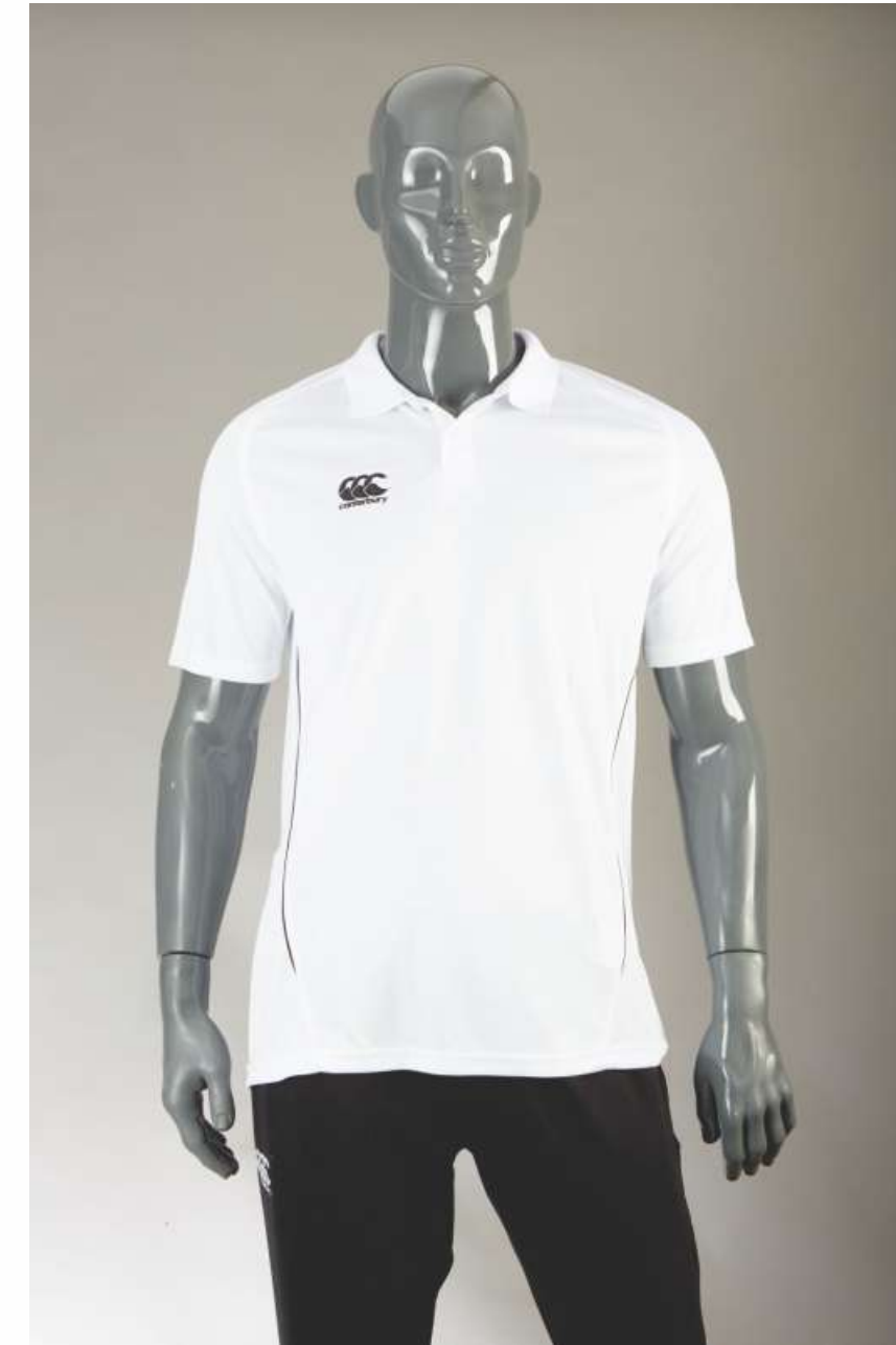
W H I T E