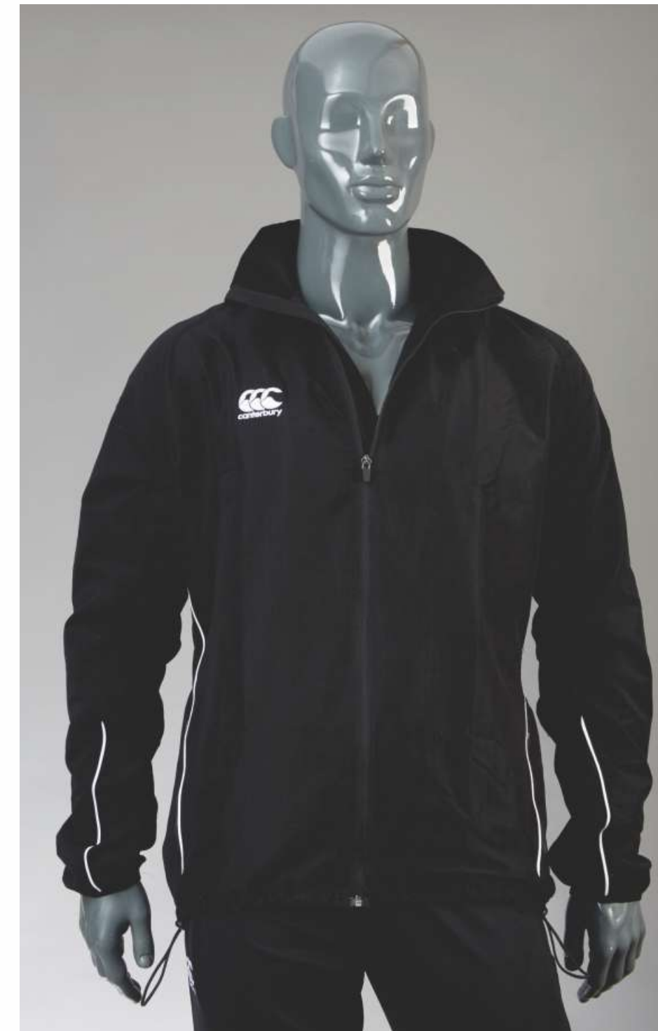
B L A C K

This 100% polyester jacket will keep you warm and protected against the elements, whilst offering an amazing range of movement and comfort during training or stepping out.