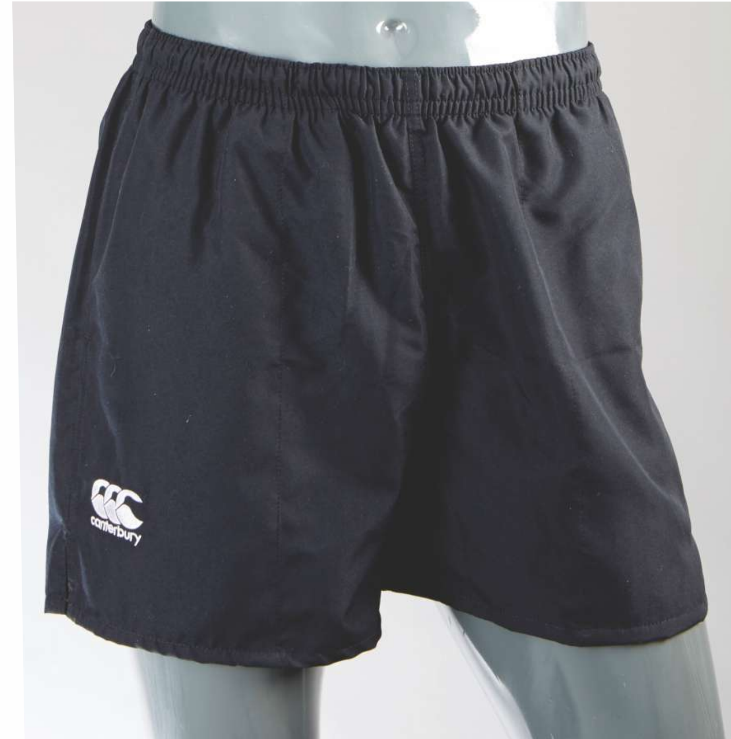
B L A C K