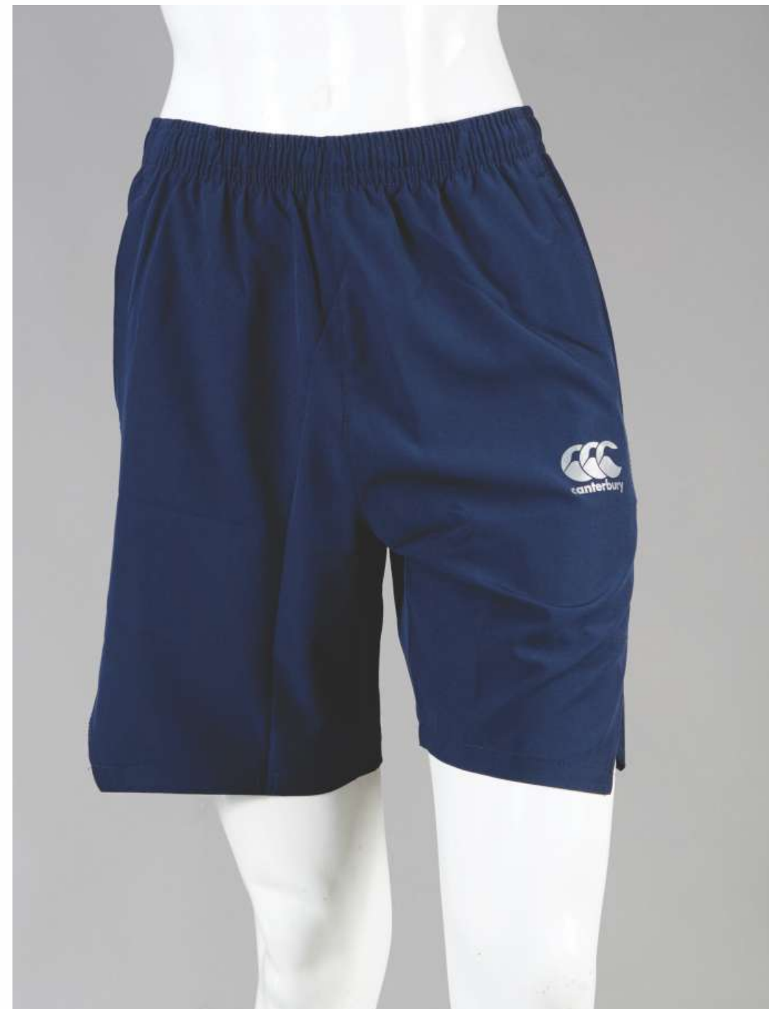
N A V Y