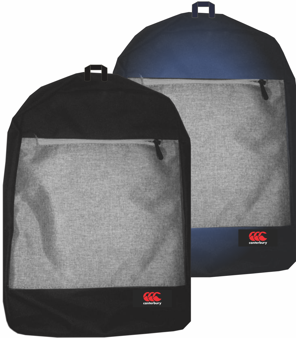
LAPTOP BACK PACK

AVAILABLE IN: BLACK & GREY AND NAVY & GREY