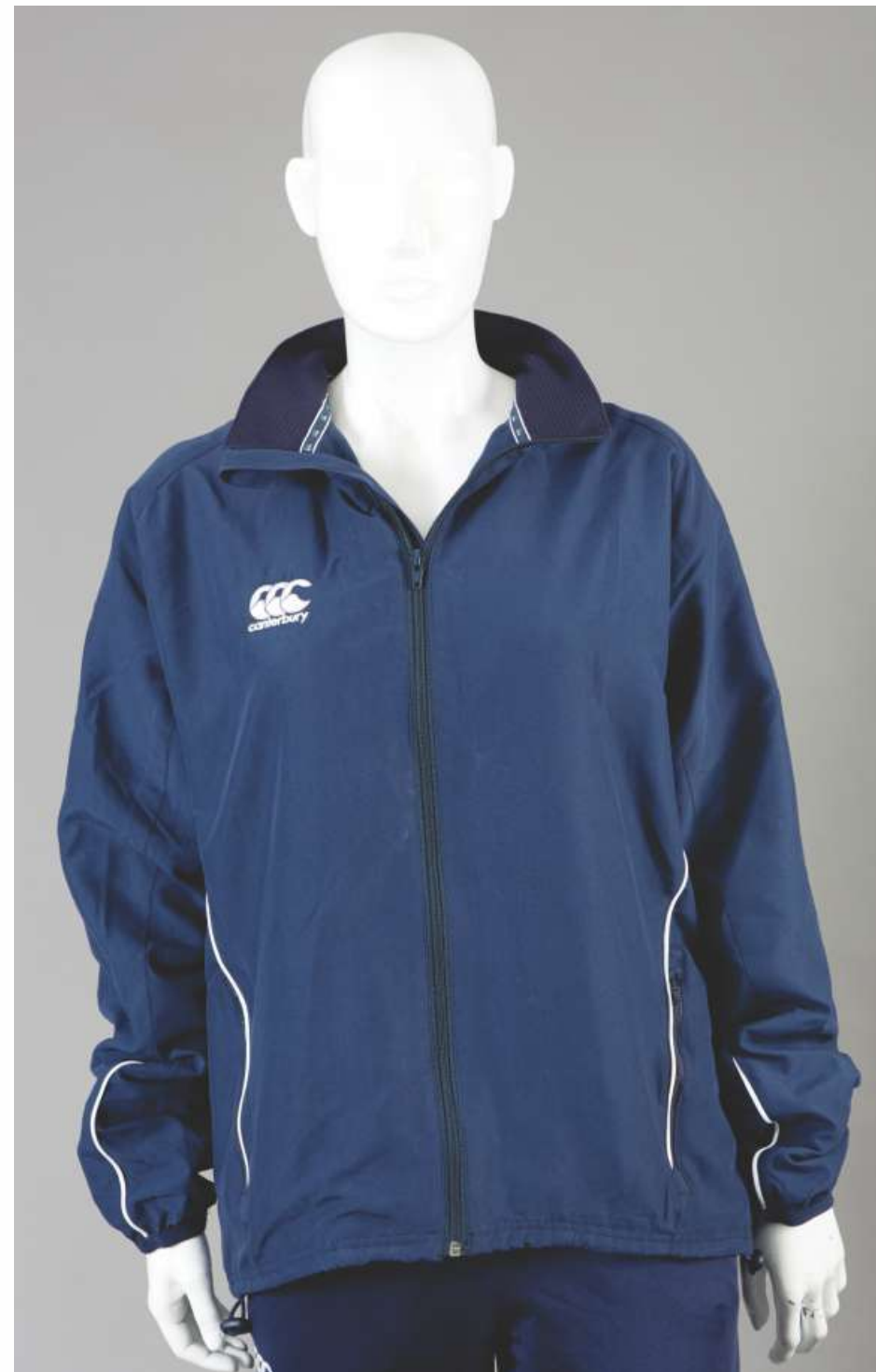
N A V Y