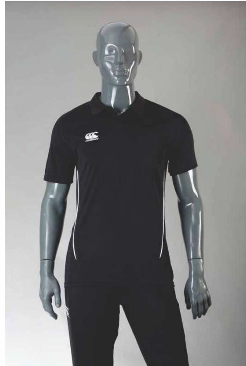
B L A C K