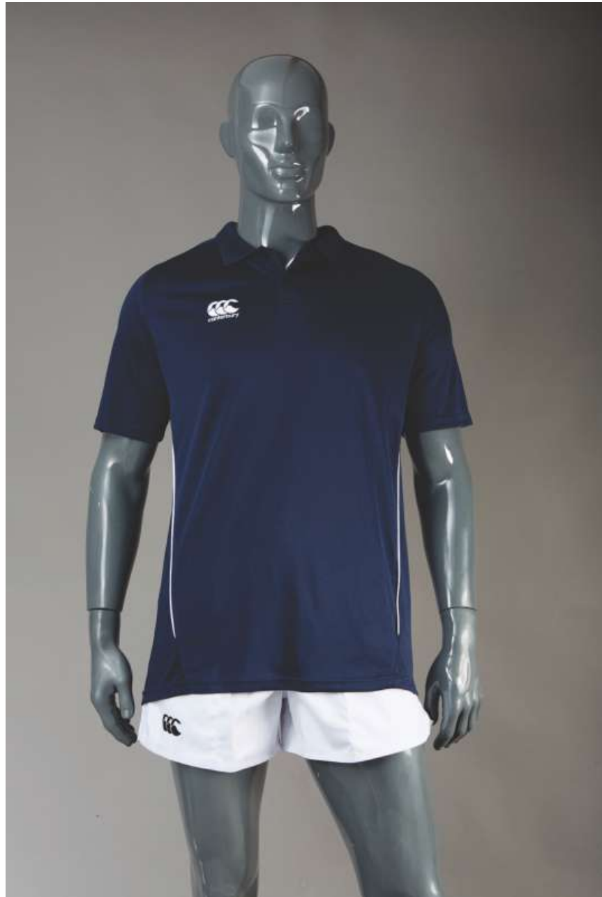
N A V Y