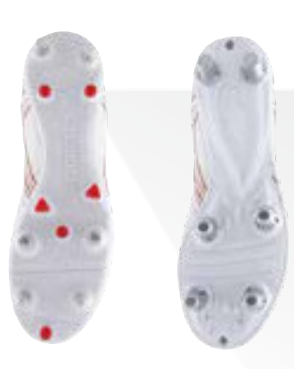
Size 2-5 Sole Detail