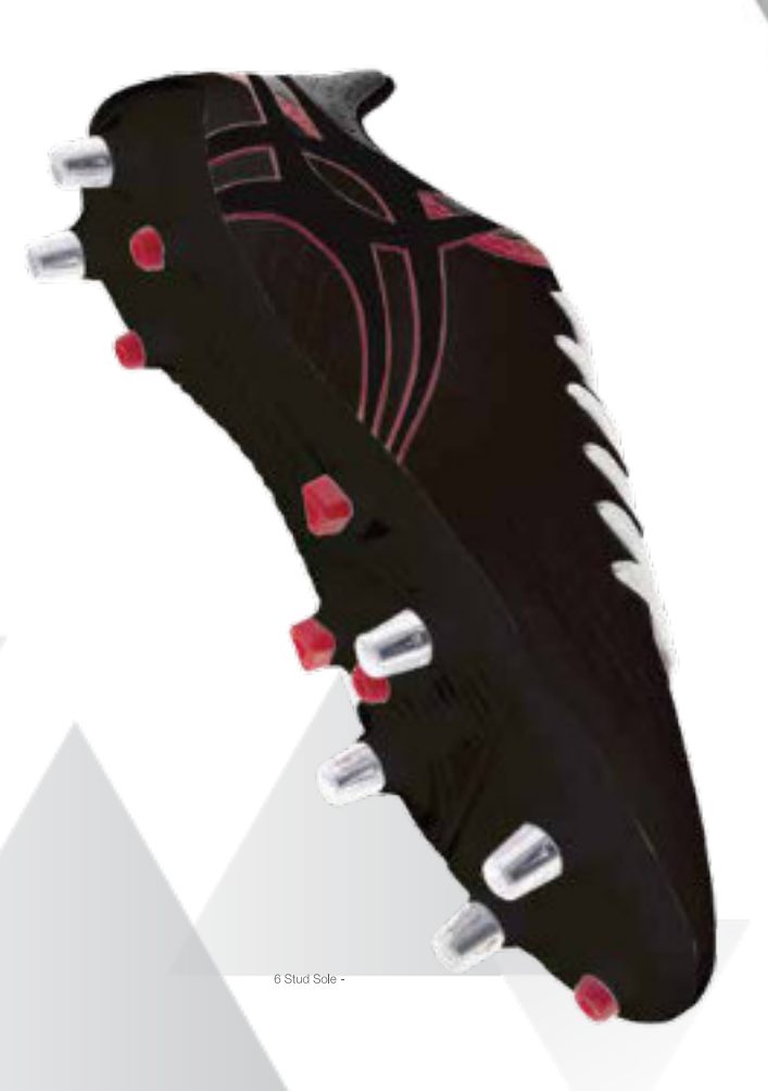
Above image is just for visual representation - Actual Boot will be Black