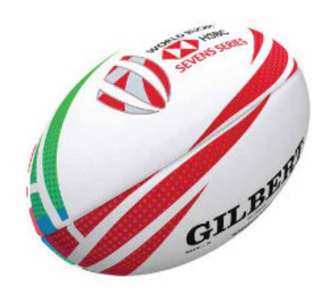
COSMETIC MAY VARY