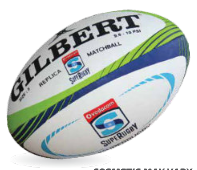
COSMETIC MAY VARY