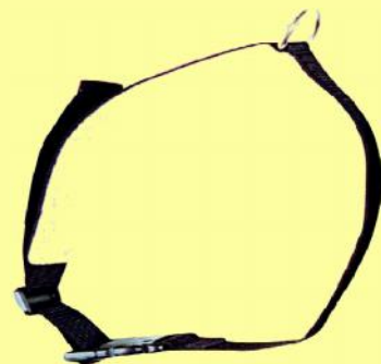
SPARE BELT WITH DOUBLE SAFETY LOCK

MIX 'N MATCH THE ATTACHMENTS AVAILABLE, TO CREATE A WORLD OF VARIABLE TRAINING OPTIONS