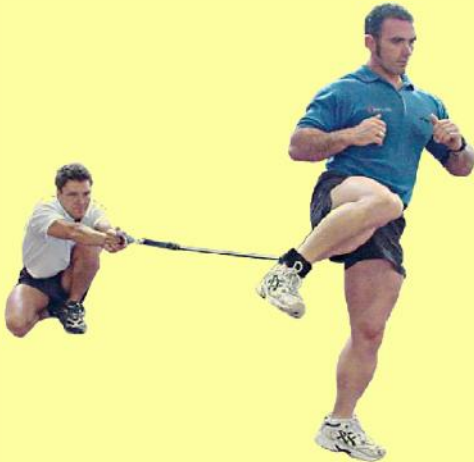
LEG SPEED TUBE