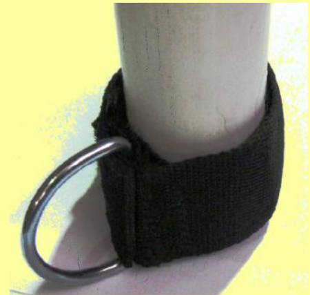
POST FIXING CLAMP