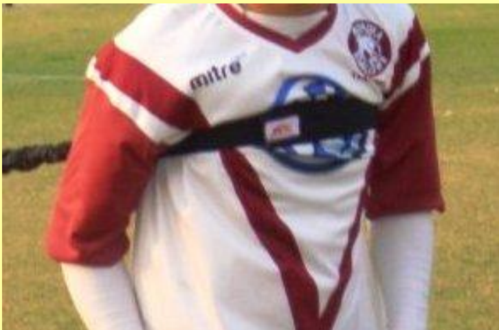
SPARE QUICK RELEASE BELT MAY BE USED WITH POWER SPEED SLED