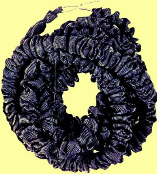
3 & 6 METER SPARE FLEXICORDS WITH SAFETY SHEATH